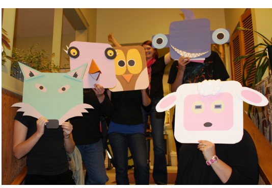
Eagleridge Elementary assembly presentation, September, 2012.

New in 2012 CUSTOM ASSEMBLY PRESENTATION at Eagleridge Elem.